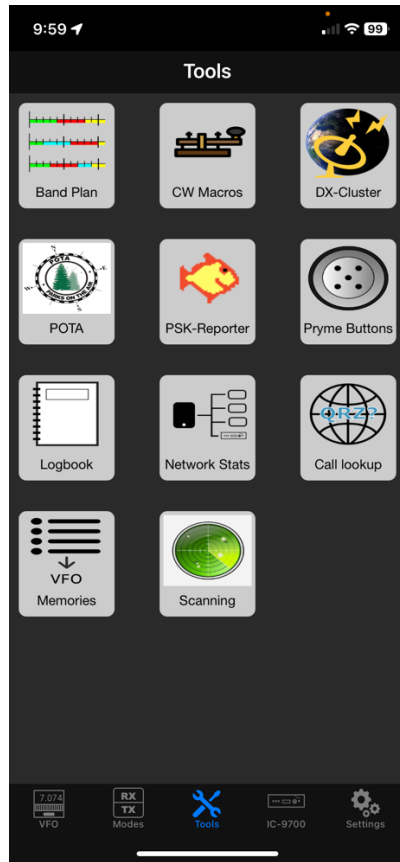
Figure 3 – Tools menu.